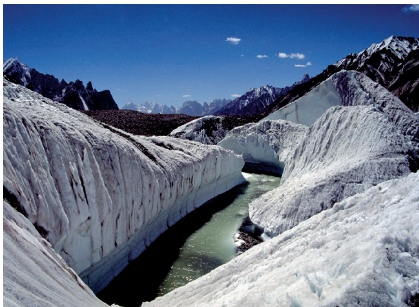
The Baltoro Glacier in the Karakoram mountain range feeds the river Indus.